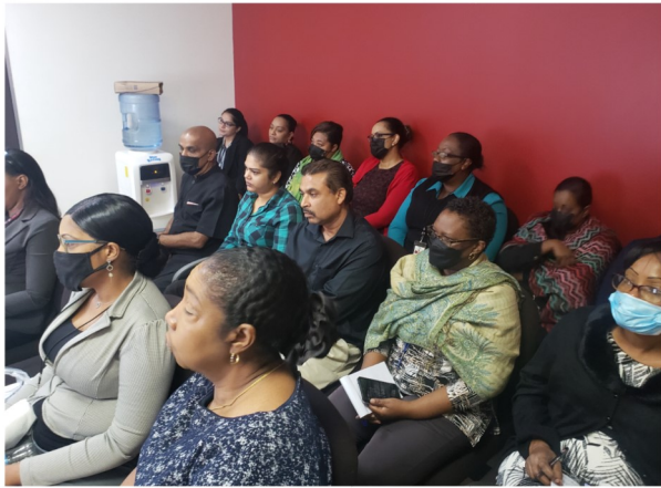
Photo: Staff during the Foster Care and Adoption presentation.