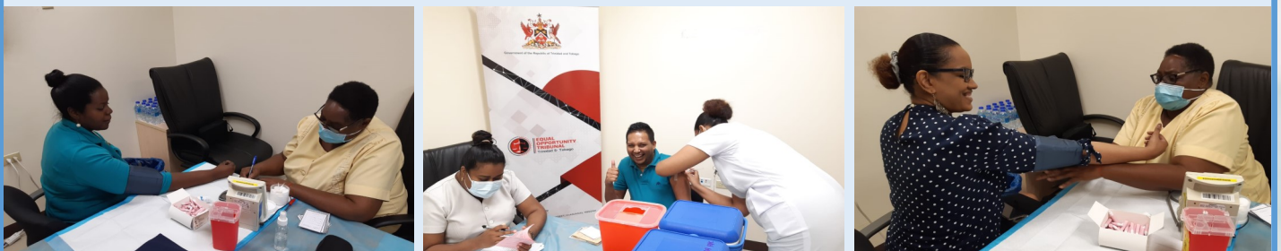
Photos: Members of the Equal Opportunity Tribunal and the Equal Opportunity Commission participating in the Health and Vaccination Drive.